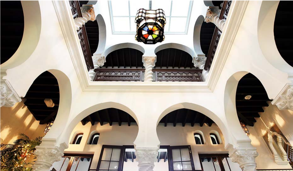
Locally landmarked and on the National Register, Villa Katharine (above) will be open for tours on Saturday.

September 11-12, 2009 Quincy Arts Center, 1515 Jersey